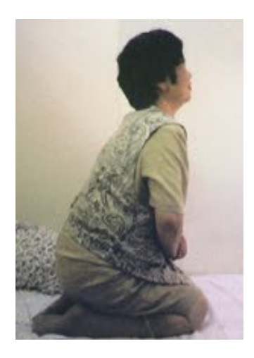
Patient Six 1. A 75-year-old man complaining of low back pain.

5. Because the patient had to travel far, she came for treatment only oncer per week. This photo shows continuing improvement.